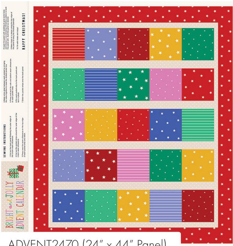
ADVENT2470 (24" x 44" Panel)